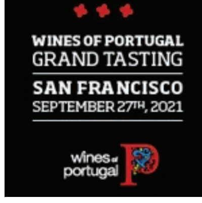
TABLE N° 23