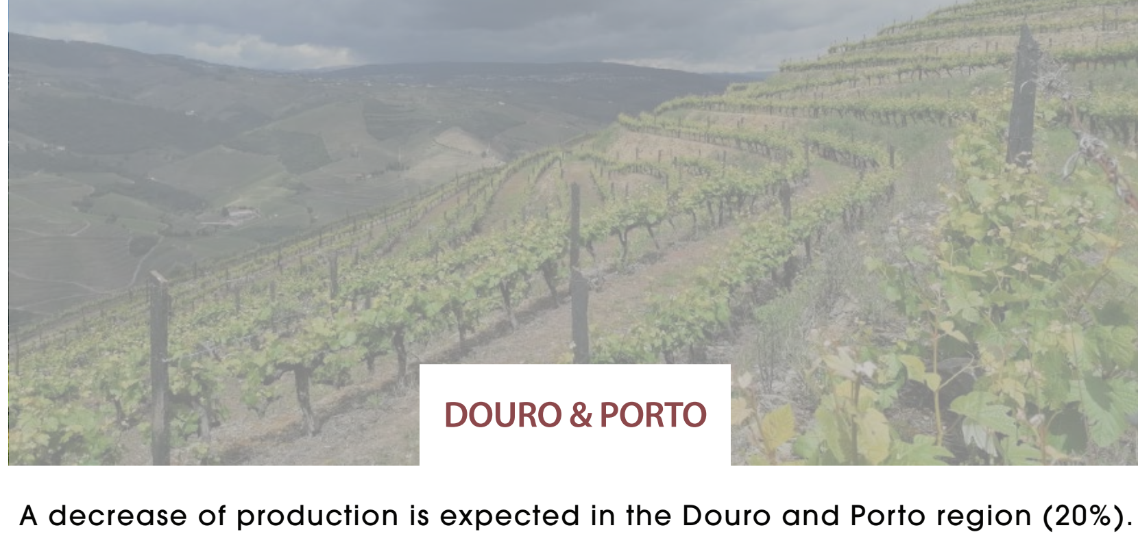
DOURO & PORTO

The climate instability may, however, condition the current forecast.