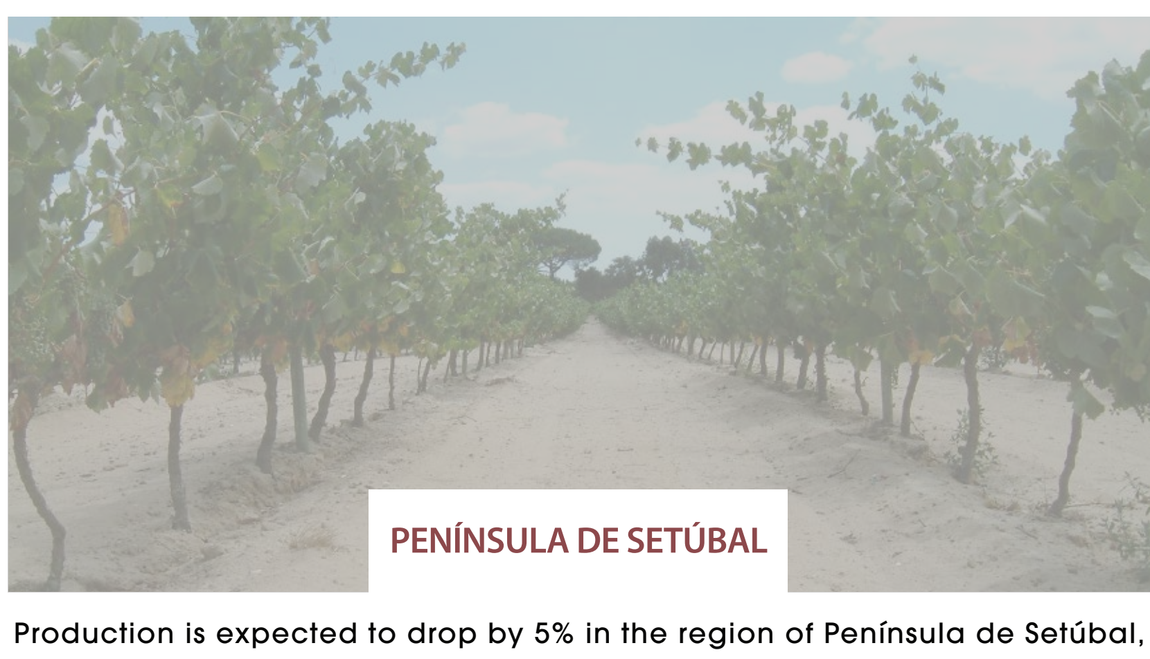
PENÍNSULA DE SETÚBAL

However, the scalding problems that occurred interrupted the vegetative cycle of the plants. Still, the production is expected to increase by 5% in the region.