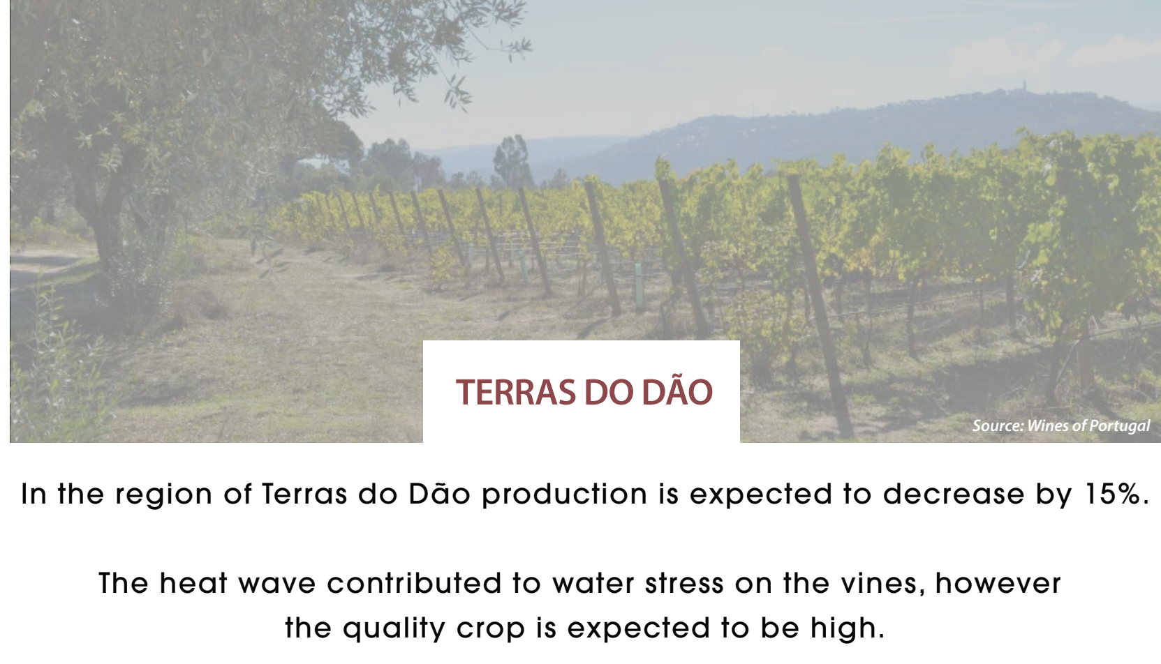
TERRAS DO DÃO

The heat waves (causing sunburn) and lack of water have accentuated the stress situations that affect grape maturation and yield.