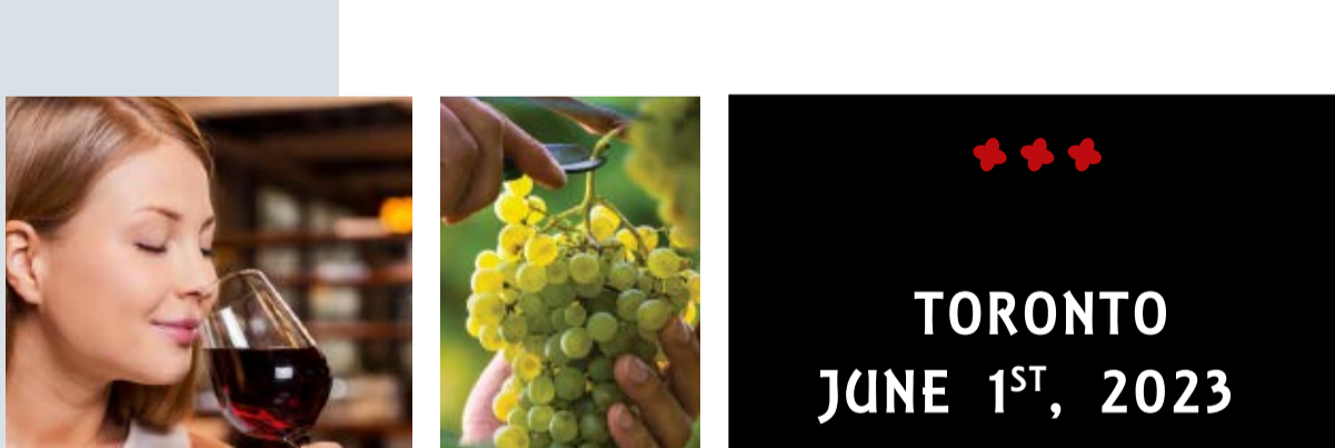
TABLE N° 11