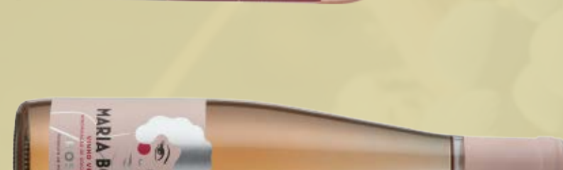
Maria Bonita Rosé Vinho Verde D.O.C. 2022