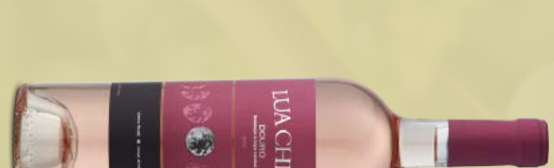
Lua Cheia Rosé D.O.C. Douro 2022