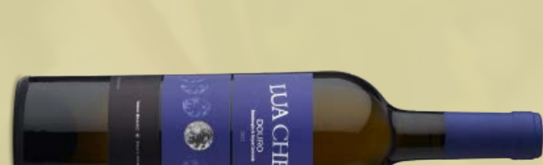
Lua Cheia White D.O.C. Douro 2022

Check out our new Wine Releases and try it!