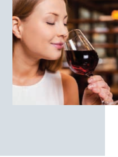
TABLE N° 5